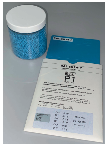
Fig. 2. RAL color charts serve as references for the analyses.

As the proportion of recycled materials in packaging increases, so do the imposed quality requirements. Consist-